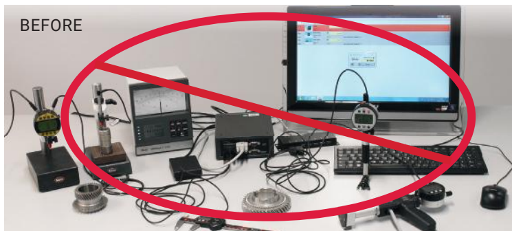
Conventional measuring station –with cable connection

FREE MarCom Professional 5.2 Software Interface