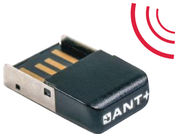
The MarConnect i-Stick