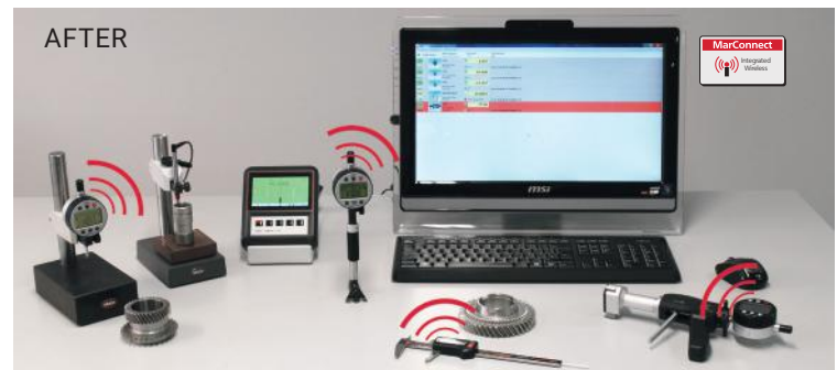
Innovative measuring station – with Integrated Wireless

For more information please visit or contact